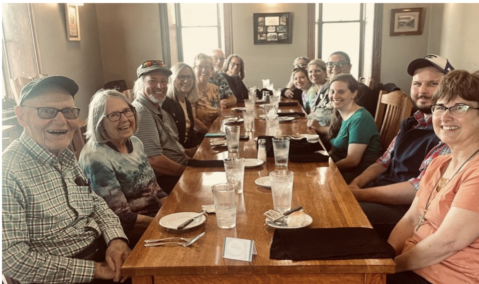
Trinity Lutheran Church's First Friday Fellowship at Midland Railroad Hotel & Restaurant in Wilson, Kansas.

everyone purchases their own food and drink (although we do offer rides and can purchase meals as needed, if folks contact the office ahead of the event), and we enjoy one another's company.